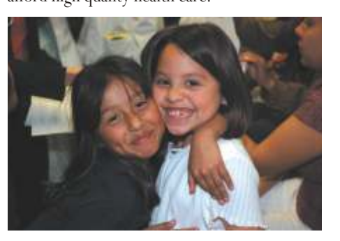
Happy patients at Hamilton Elementary.

We live in a time of great paradox for many this is an era of unprecedented affluence and unbounded opportunity, while millions of others are mired in poverty with little or no access to basic human needs including health care. Since its inception, Southwest College committed time, people and funding to treat thousands of Arizonans who deserve, but can't afford high quality health care.