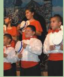
Children from Hamilton Elementary proudly perform at the 2005 Red Ball.

Since 2002, the Hamilton Clinic has expanded its services and hours, offering care three days per week to both children and their families. Three other elementary schools in the Murphy School District where Hamilton is located, Kuban, Sullivan and